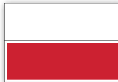
HALF PAGE HORIZONTAL SPREAD