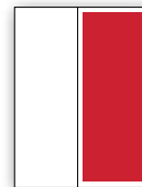
HALF PAGE VERTICAL

TRIM SIZE: 8" X 10-3/4" BINDING: PERFECT BOUND PRINTING PROCESS: 4-COLOR HEATSET WEB OFFSET 150 LINE SCREEN PAPER: COVER—100# COATED GLOSS; BODY—50# COATED GLOSS