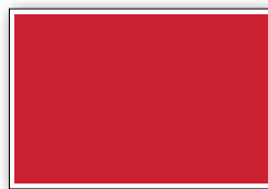
FULL PAGE SPREAD