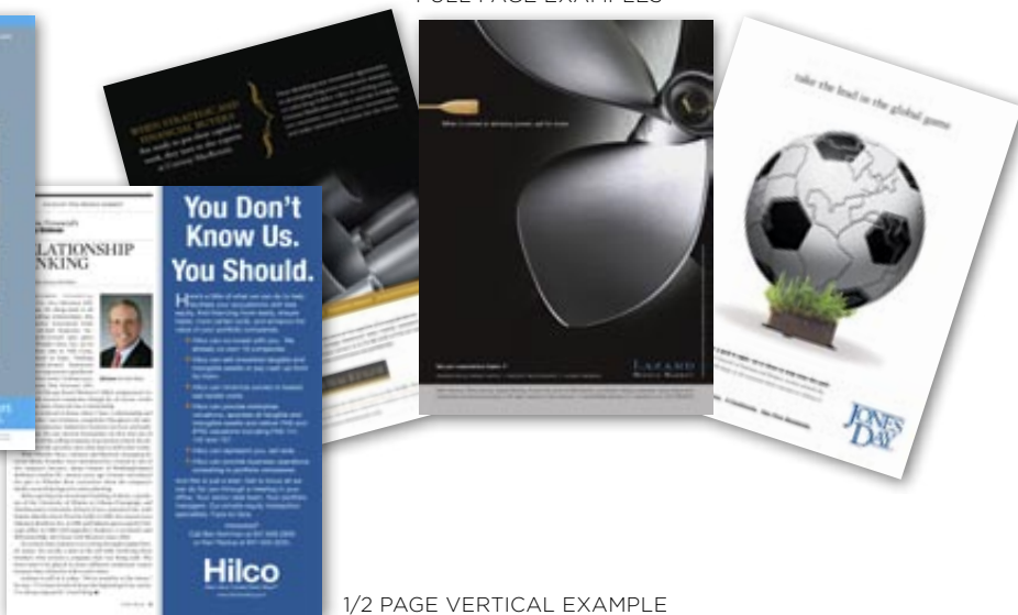
1/2 PAGE VERTICAL EXAMPLE